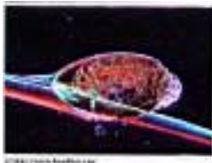
Louse Egg or "Nit"

The Rush-Henrietta Central School District Nursing Staff